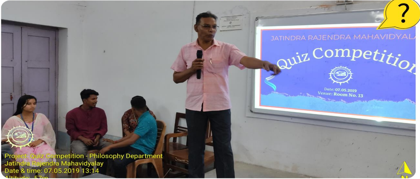
Project: Quiz Competition - Philosophy Department Jatindra Rajendra Mahavidyalaya Date & time: 07.05.2019 13:14 Altitude: 57m