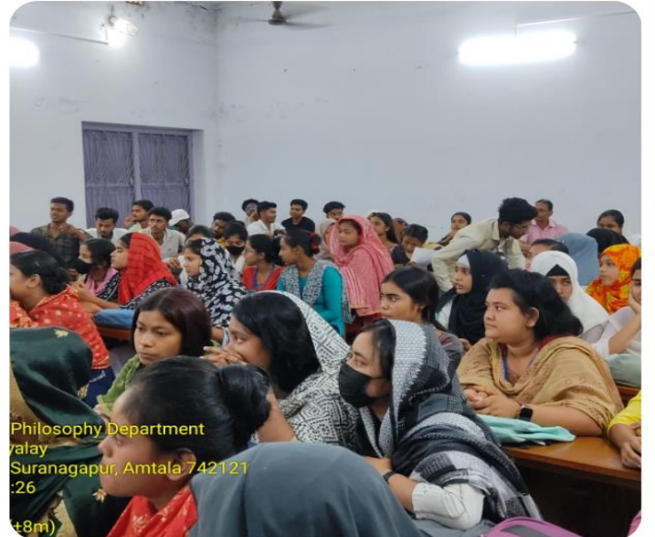
Philosophy Department Jatindra Rajendra Mahavidyalaya Char Suranagapur, Amtala 742121 Date & time: 07.05.2019 13:26 Altitude: 57m NGS84: 23.93307, 88.45816 (+6m)