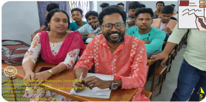
Project: Quiz Competition - Philosophy Department Jatindra Rajendra Mahavidyalaya Address: WFM6+57V, Char Suranagapur, Amtala 742121 Date & time: 07.05.2019 13:32 Altitude: 57m NGS84: 23.93307, 88.45816 (+6m)