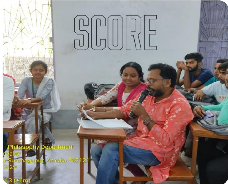
Philosophy Department Jatindra Rajendra Mahavidyalaya Char Suranagapur, Amtala 742121 Date & time: 07.05.2019 13:29 Altitude: 57m NGS84: 23.93307, 88.45816 (+6m)