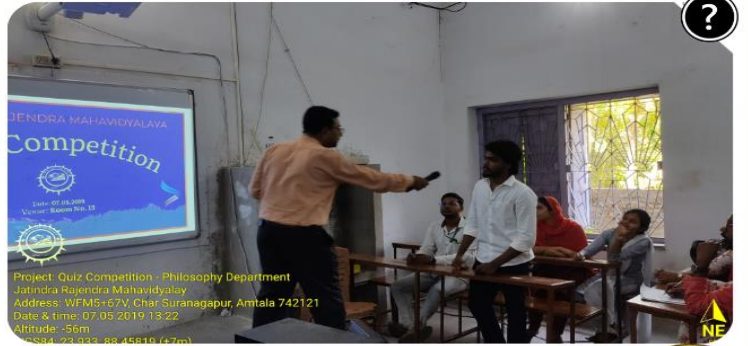
Project: Quiz Competition - Philosophy Department Jatindra Rajendra Mahavidyalaya Address: WFM6+57V, Char Suranagapur, Amtala 742121 Date & time: 07.05.2019 13:22 Altitude: 57m NGS84: 23.93307, 88.45816 (+6m)