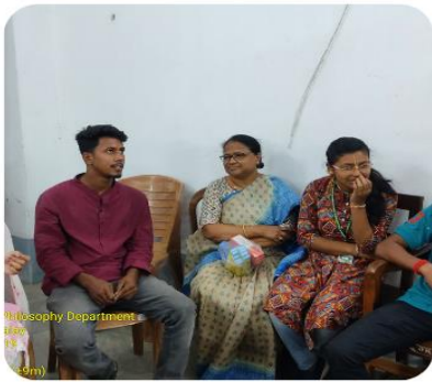
Philosophy Department Jatindra Rajendra Mahavidyalaya Date & time: 07.05.2019 13:29 Altitude: 57m NGS84: 23.93307, 88.45816 (+6m)