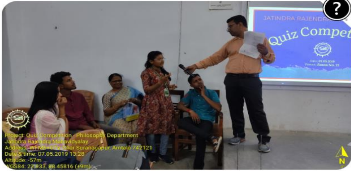
Project: Quiz Competition - Philosophy Department Jatindra Rajendra Mahavidyalaya Address: WFM6+57V, Char Suranagapur, Amtala 742121 Date & time: 07.05.2019 13:22 Altitude: 57m NGS84: 23.93307, 88.45816 (+6m)